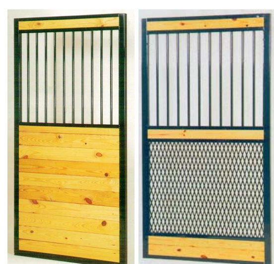
Standard Door HD4

Door frames and grille are fully assembled and welded as one piece using 14 ga. steel with a black powder coat gloss finish. Tubular steel pickets are 7/8" OD x 16.ga. and spaced 4" oc. Doors are shown with 2"x6" beveled edge tongue and groove boards, sold separately. Doors 48"w x 88" h.