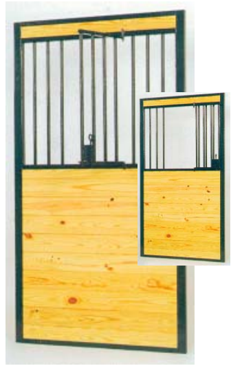
Door w/ Swinging Panel HD4SP